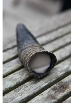
Ground silica being mixed with water and put in cow horn, ready to be buried.