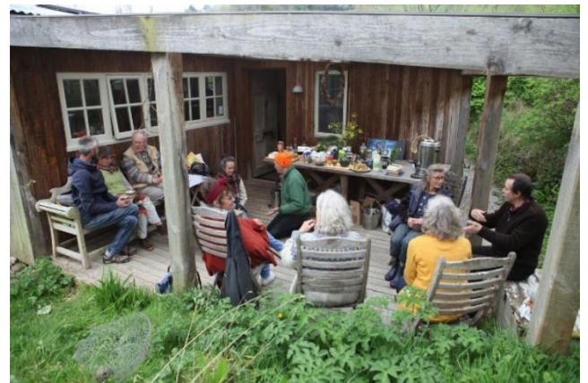
The 'being prepared' and the 'already prepared' preparations. Of course there were plenty of refreshment breaks.