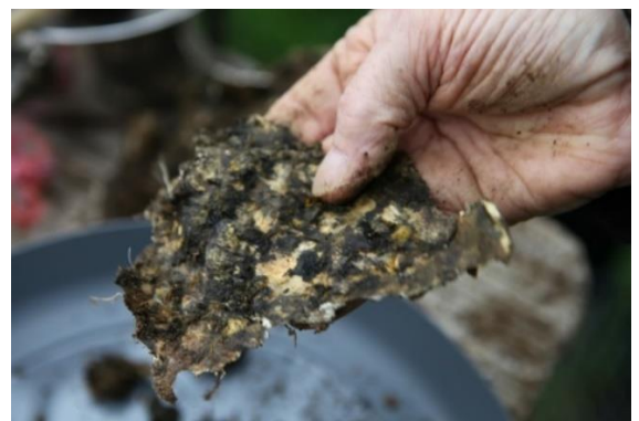
The nettle and dandelion preparations after being dug up.