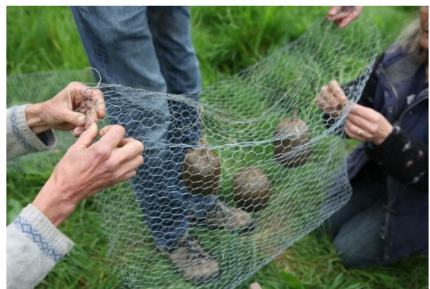
Completed bladder tied tightly and being put in a protective 'cage' before being hung in a tree to get the summer sun.